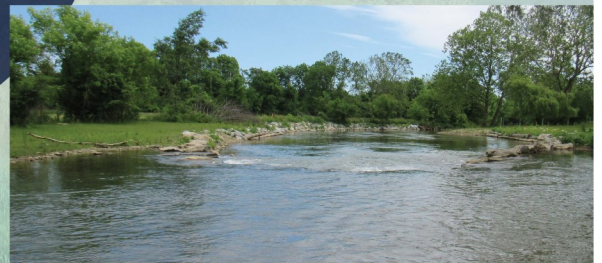
Restored Tulpehocken Creek on Zartman Farm - Cross rockvane to concentrate flows and built out left bank