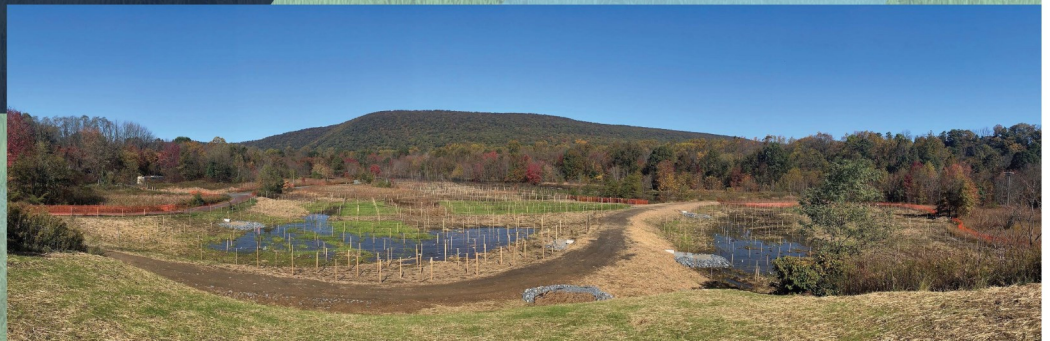
Desilting Basin mitigation site during construction, showing diversity of habitat and improved ADA trail