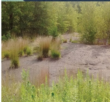
Desilting Basin mitigation site before mitigation, showing poor soils