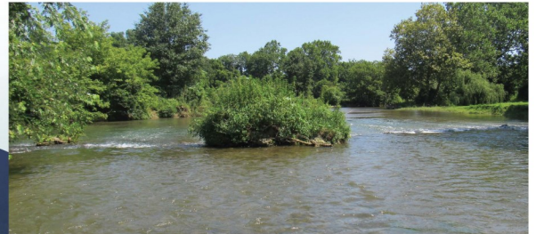
Tulpehocken Creek on Zartman Farm - Overwide channel with mid channel bar

The restoration of Tulpehocken Creek on the Zartman Farm improved a degraded section of stream. This area was targeted by the Pennsylvania Fish and Boat Commission (PFBC) for improvement and restoration. The restoration design included the narrowing of the channel to the appropriate bankfull width through the use of in-stream rock structures, boulder bank revetment and mud sills. PFBC best management practices were incorporated into the design.