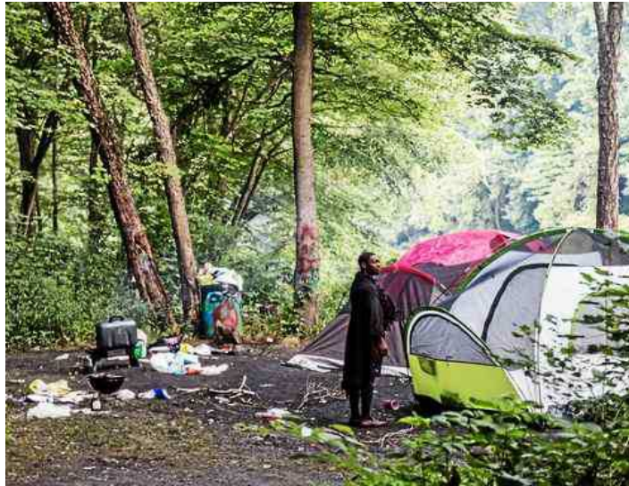
7/24 Camping at the Rope Swing above the Upper Parking Lot—Neven Dries

On July 7th, Nick Savino posted a video to Youtube entitled “WILD THINGS - PEACE