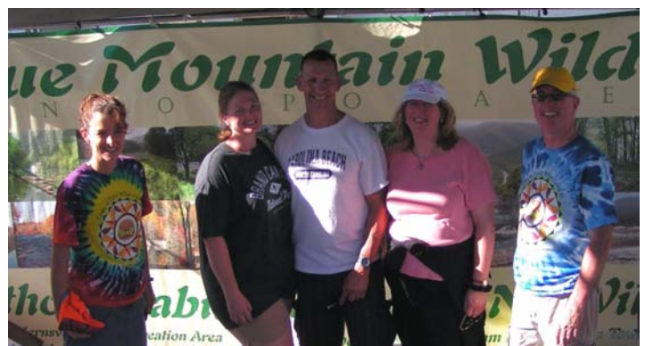
Hamburg-er Festival Hamburger Eating Contest Officiating Crew